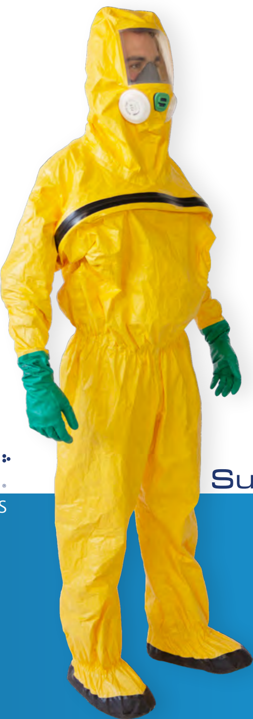
SubiTUS® ALL IN ONE