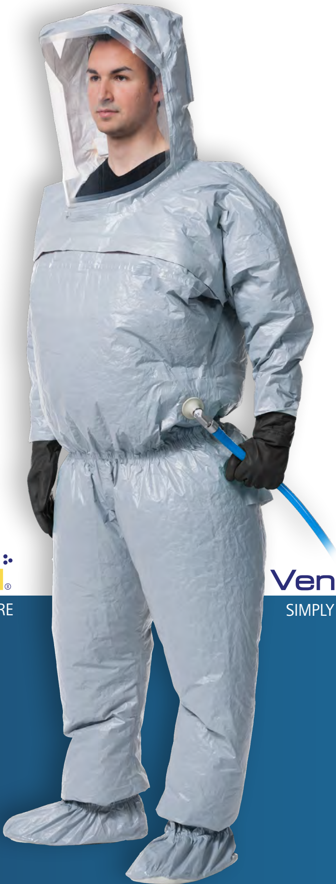
VenPIPE® SIMPLY SAFER WORK