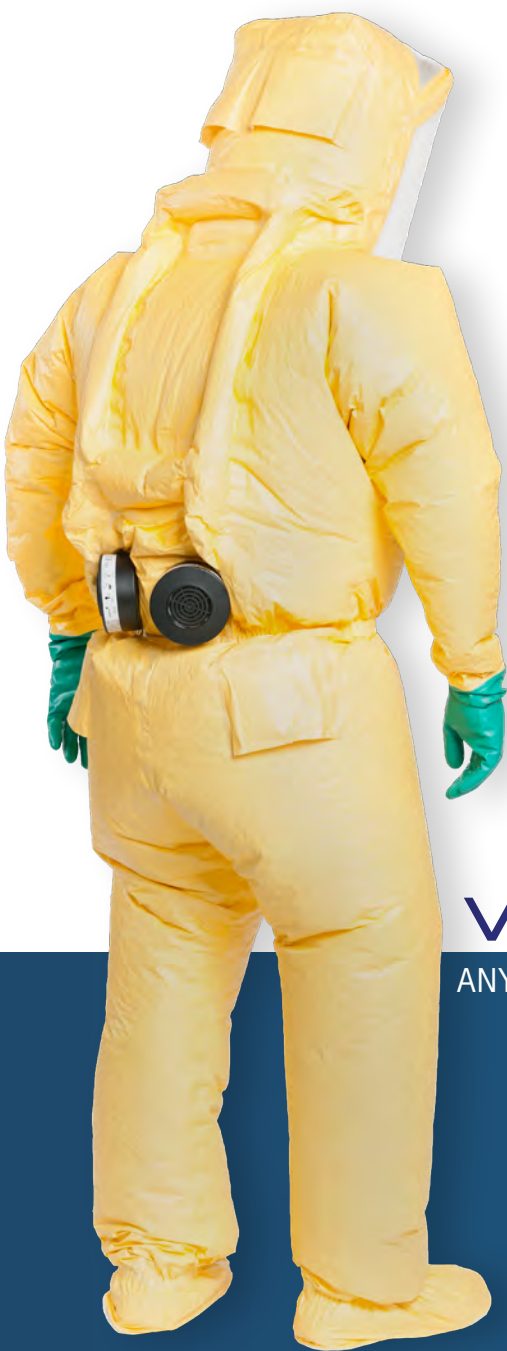
VenION® ANYTIME, ANYWHERE

Highest quality standards and intensive practice tests ensure maximum safety, so the wearers can carry out their tasks with a clear head.